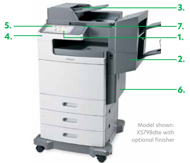
Model shown: XS798dte with optional finisher

Choose from four output options, including a five-bin mailbox, an offset stacker, a staple finisher and a staple with hole punch finisher.